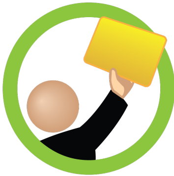
Free Online Resources