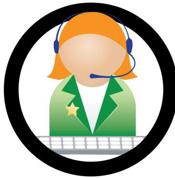
Live Online Help